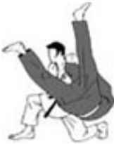
uki otoshi floating drop