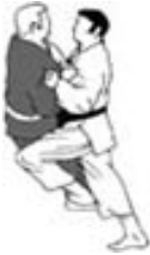
ko soto gake minor outer hook