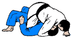
tate shiho gatame vertical four quarter hold down