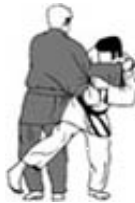
o soto guruma major outer wheel