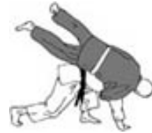
soto makikomi outer wind up