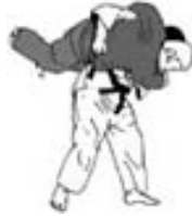
utsuri goshi changing hip